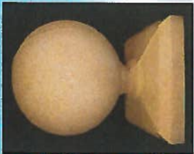
Pacific Stone Design Inc. FB-12