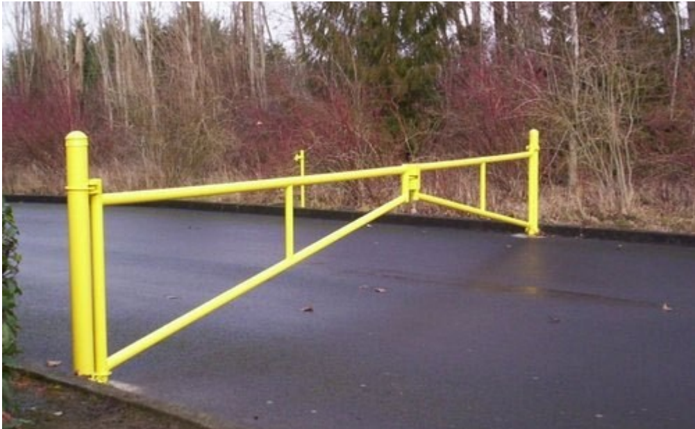
Vehicular Gate Reference Pictures