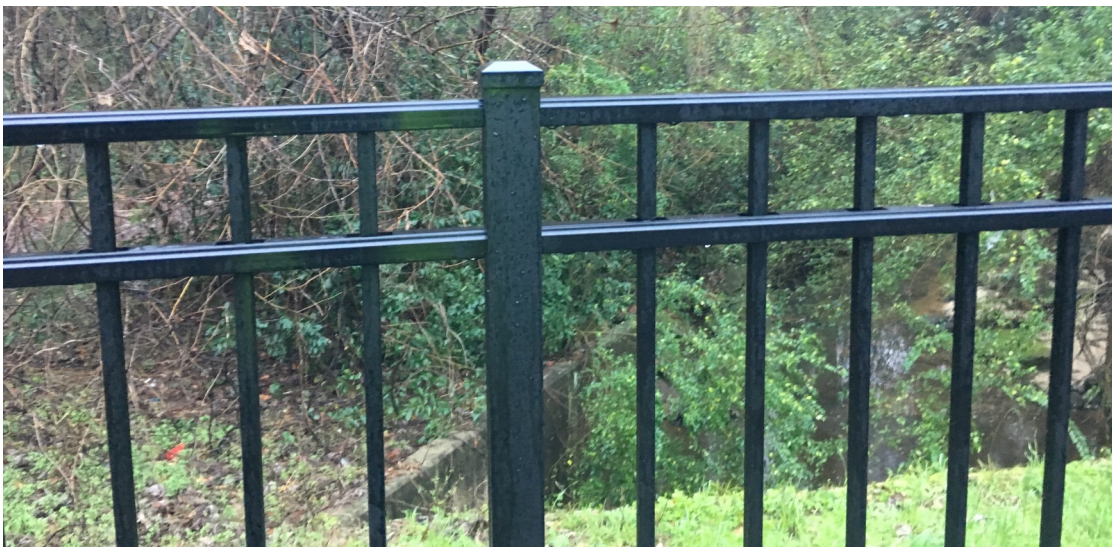
Fence Reference Pictures