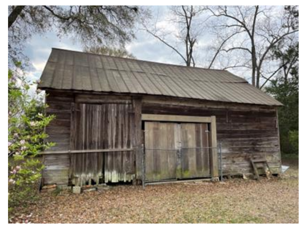
Outbuilding believed to be original stable.